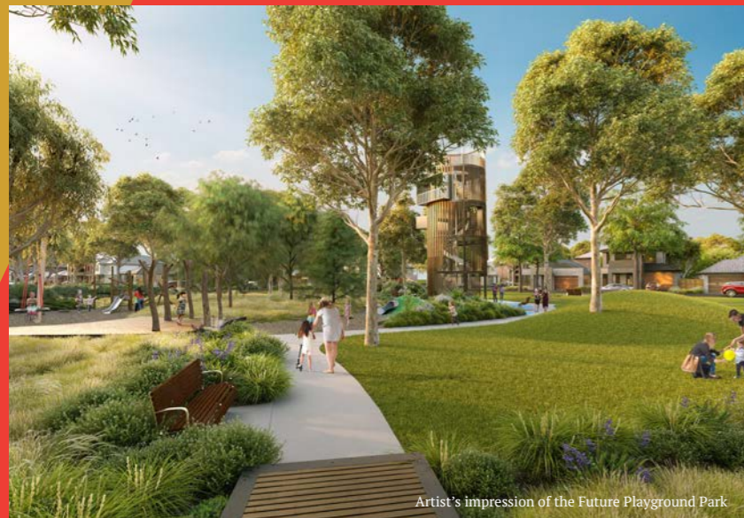
Artist's impression of the Future Playground Park.

Plans subject to change. Sporting facilities subject to council requirements. Please review Plan of Subdivision prior to purchase.