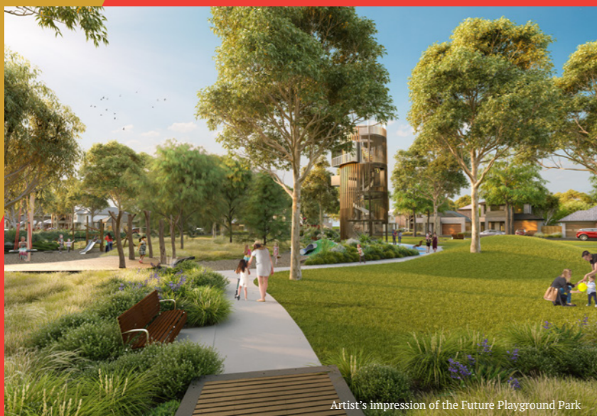
Artist's impression of the Future Playground Park

Childcare & preschool close by Sporting & recreational facilities nearby Fenced off-leash dog park Tennis & netball courts