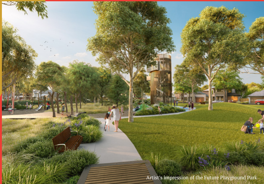
Artist's impression of the Future Playground Park

Childcare & preschool close by Sporting & recreational facilities nearby Fenced off-leash dog park Tennis & netball courts