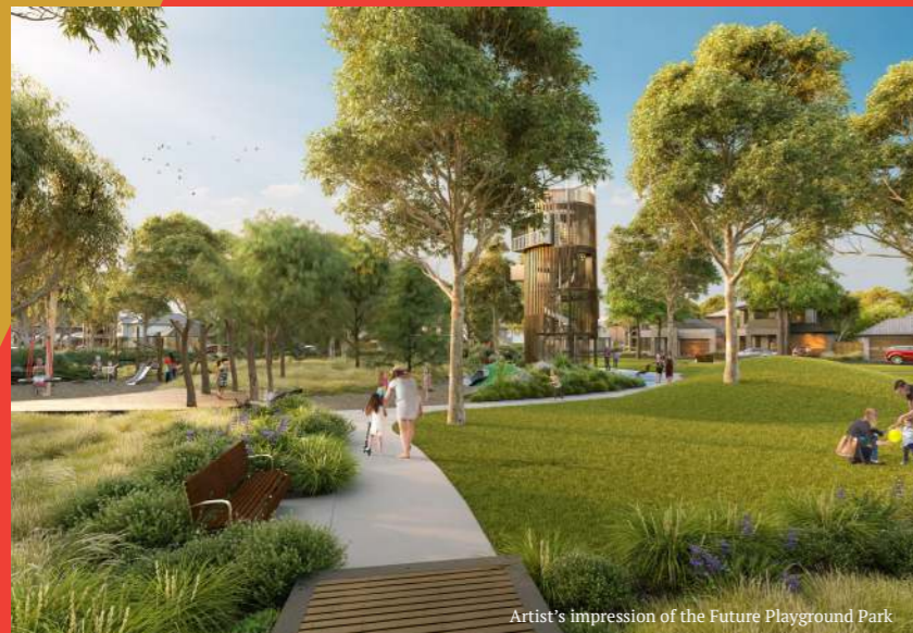
Artist's impression of the Future Playground Park

Childcare & preschool close by Sporting & recreational facilities nearby Fenced off-leash dog park Tennis & netball courts