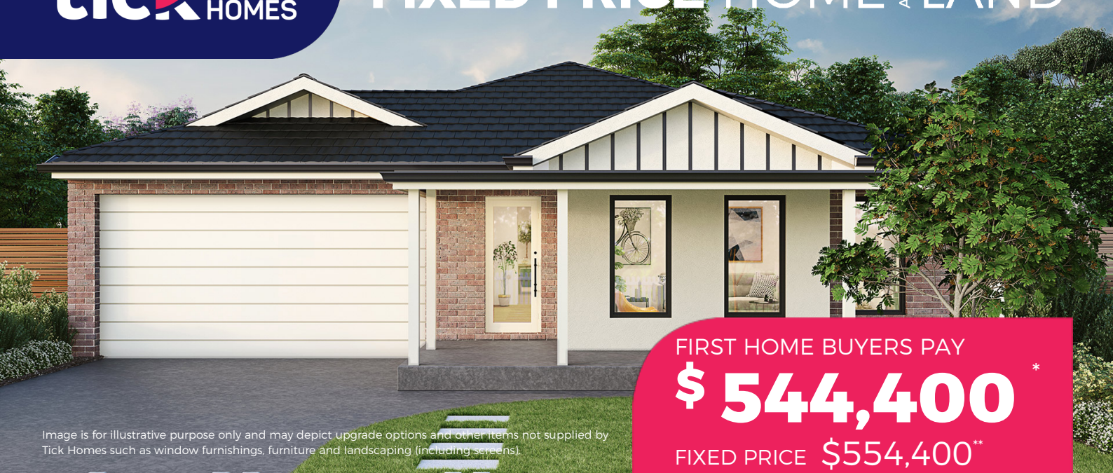
Image is for illustrative purpose only and may depict upgrade options and other items not supplied by Tick Homes such as window furnishings, furniture and landscaping (including screens).