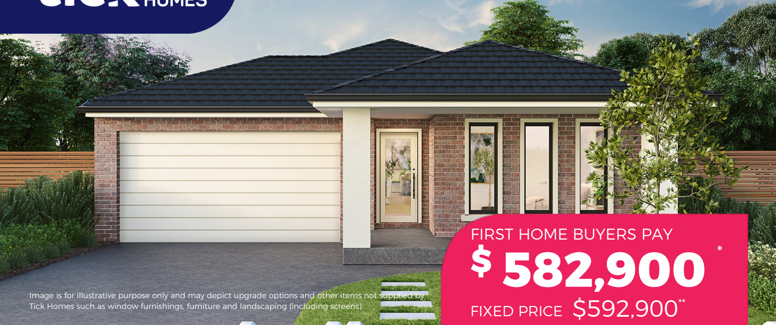
Image is for illustrative purpose only and may depict upgrade options and other items not supplied by Tick Homes such as window furnishings, furniture and landscaping (including screens).