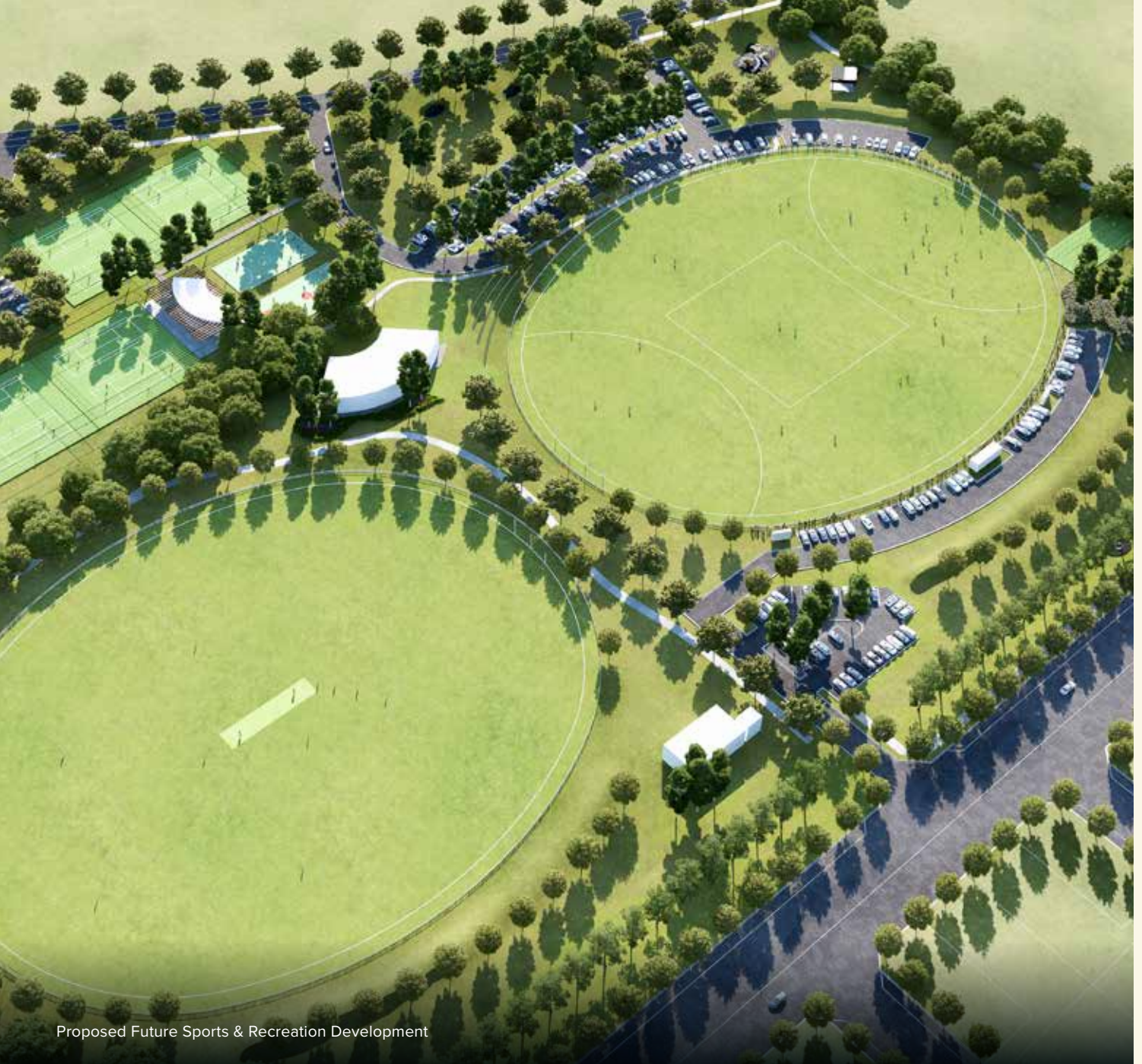
Proposed Future Sports & Recreation Development